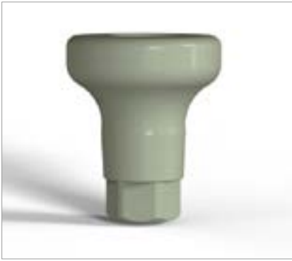
4 | Healing abutment with concave running room.