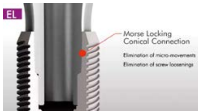
3 | Platform-switching concept.