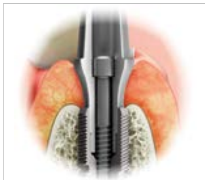
2 | Innovative C-Tech implant design.

Linkevičius [6] showed in a recent article that there will be bone loss if the tissue biotype is thin, even when using implants with platform switching. Therefore, the surgical procedure will always include changing the soft-tissue biotype with a connective-tissue graft or membranes before or during surgery. More and more studies and clinical observations show that a concave profile of the running room creates a higher and thicker volume of peri-implant tissue [7] and maintains it in the long run [8] (see Figs. 4 to 6).