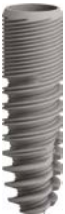
1 | Morse-tapered conical connection.

Implant success today consists of more than just “osseointegration accomplished”. We also have to take into account the aesthetic result. The present clinical case with high aesthetic patient expectations illustrates the treatment of a partially edentulous 65-year-old female patient with grade 2 mobility in all teeth.