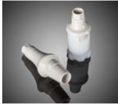
5 | Provisional/impression abutments with a concave profile (concave running room).