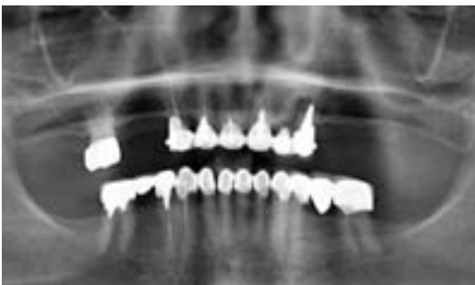
7 | Preoperative situation.

There were some buccal defects that were grafted with \beta -TCP and HA (Maxresorb, Botiss) and Osgide (Curasan). Vertical defects were grafted with the help of the sonic weld technique (KLS Martin).