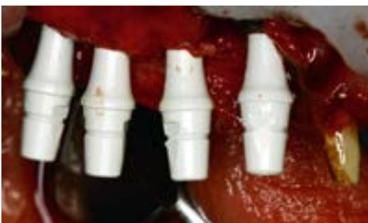
9 | Provisional abutments with 6 mm height of the concave running room.