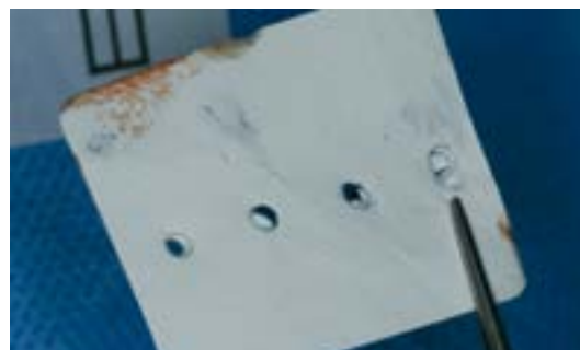
10 | The collagen membrane was perforated for overlapping the grafting buccally and palatally.