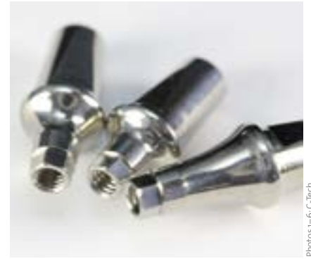
6 | Final abutments with a concave profile (concave running room).