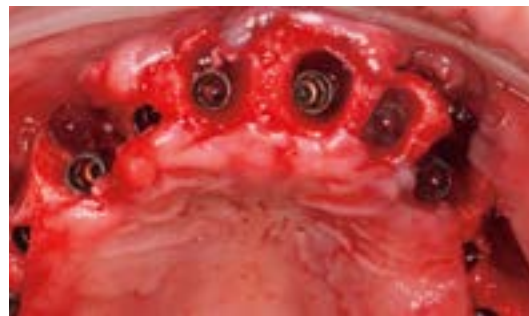
8 | Implants in place.